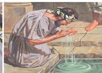
John 9: Jesus heals man born blind