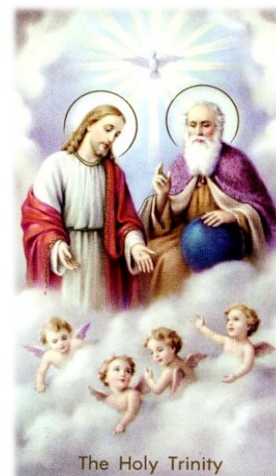
The Holy Trinity

Glory be to the Father, and to the Son, and to the Holy Spirit,