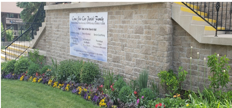
Our beautiful flower gardens at Sacred Heart